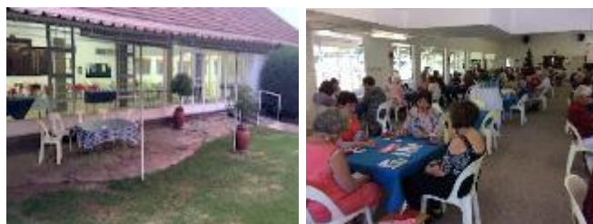
Orchards' Bridge Club 40 pairs settling in.