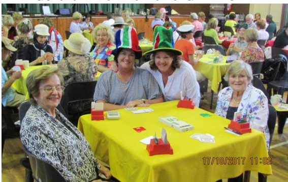
Vide les chapeaux!